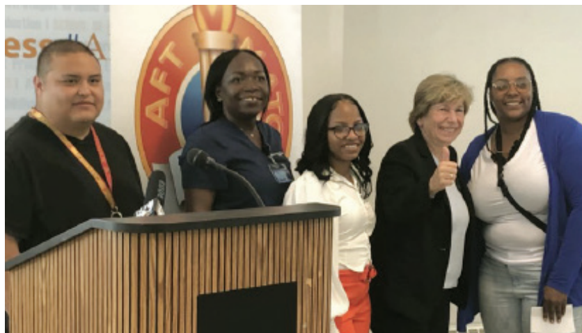
AFT President Randi Weingarten (second from right) poses with MATC students who received FAST Fund financial support.